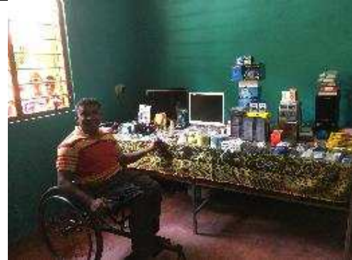
Opening of Kumare's shop