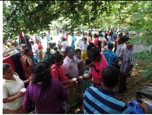
For 200 children