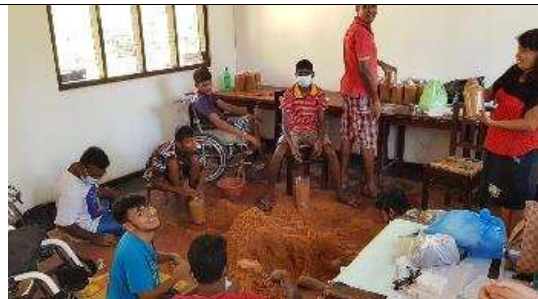
Left toys display in Marriott Hotel and to the right mushroom cultivation.