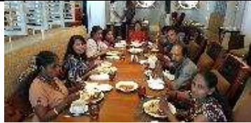
Free lunch in Marriott Hotel

During the holiday, the mason worked on the new residence building.