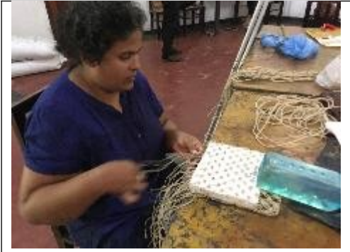
Making nice handbags.

On 8<sup>th</sup> July 2019 we introduced banana fiber training for girls with the Nawarathna foundation of Kegalle. This was the first of a series of trainings for which the girls come and stay at Hellabeem for two days every month.