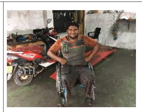
Sanka as a trainee in motor service shop.

We organized a parents' meeting for pass-out boys. The boys made a PowerPoint presentation to explain to the parents what they would be able to do after finishing the training.