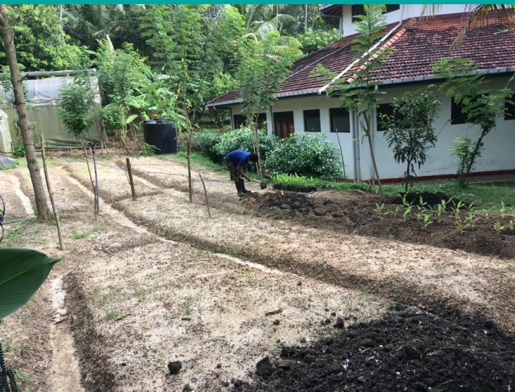
NEWLY MADE PLANT BEDS