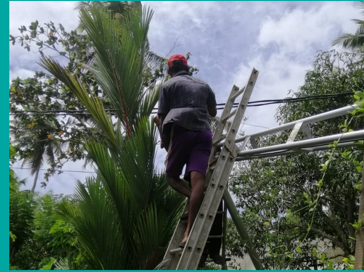
WIND MILL REPAIR

Building maintenance works are mainly done by Saman, Ajith and Dharshana. Pressure gun was used to clean moss on concrete paths and garden steps. Again wind mill was brought down to repair it's blades damaged during thunder storm. 5Amp plug bases were replaced by 13Amp according to new standards.