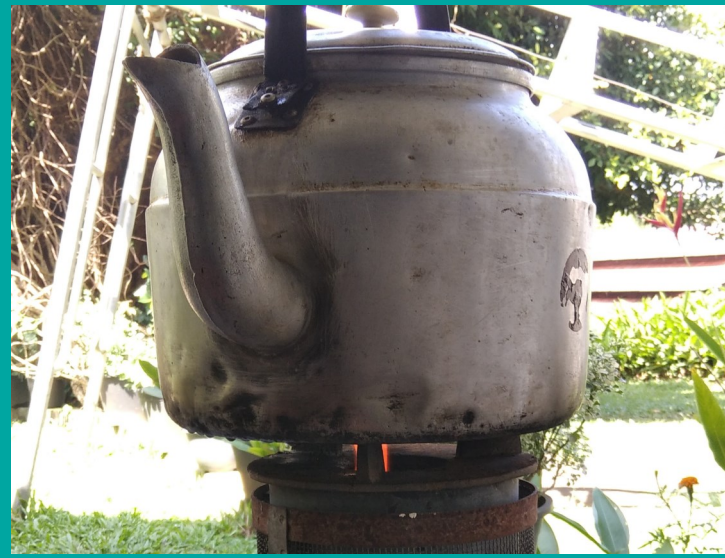
WOOD STOVE TO USE FOR BOILING WATER BE- CAUSE OF GAS SHORTAGES