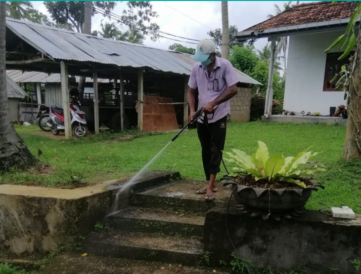
PRESSURE GUN CLEANING