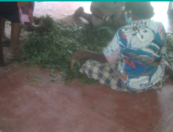
LIQUID FERTILIZER MAKING