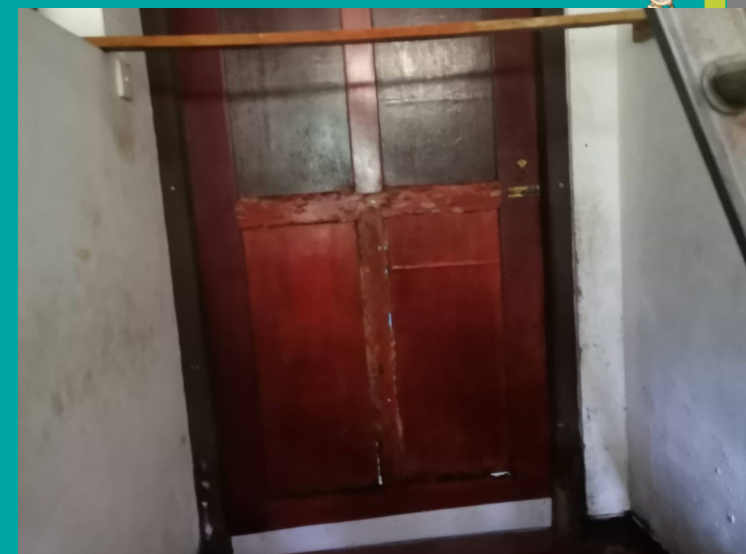
WASH ROOM TEMPORARY CONVERTED TO CHICKEN HUT