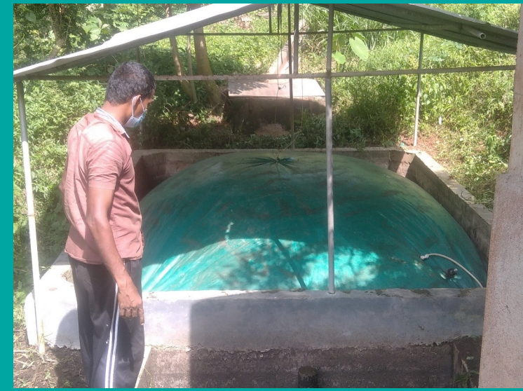
BIOGAS BALLOON REPAIR