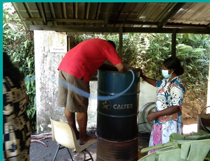
MUSHROOM MAKING EVENT