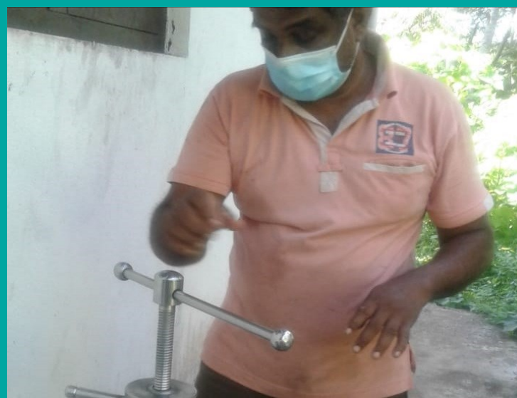
VIRGING COCONUT OIL MAKING