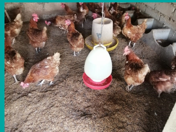
OLD CHICKENS TO DISCARD