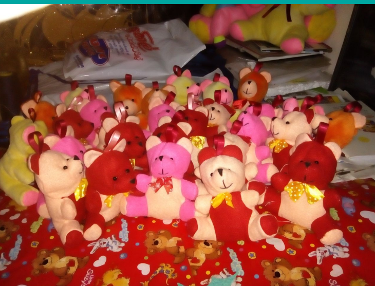
SOFT TOYS MADE BY ONE OF OUR GIRLS