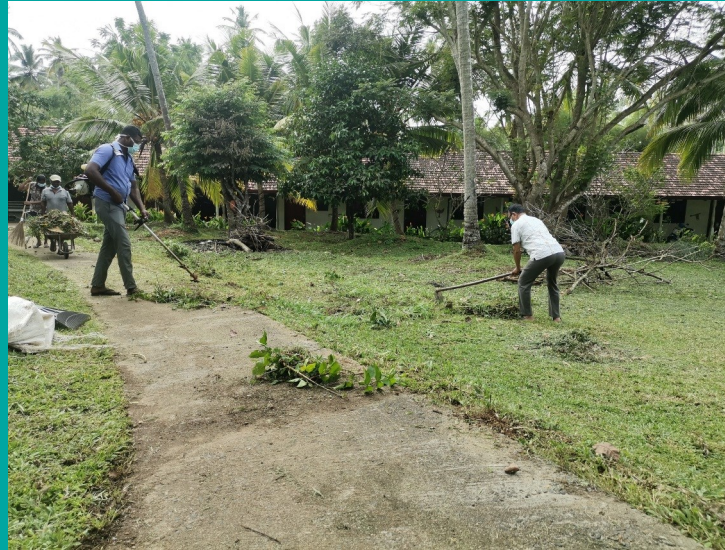
CLEARING BEFORE RE-START