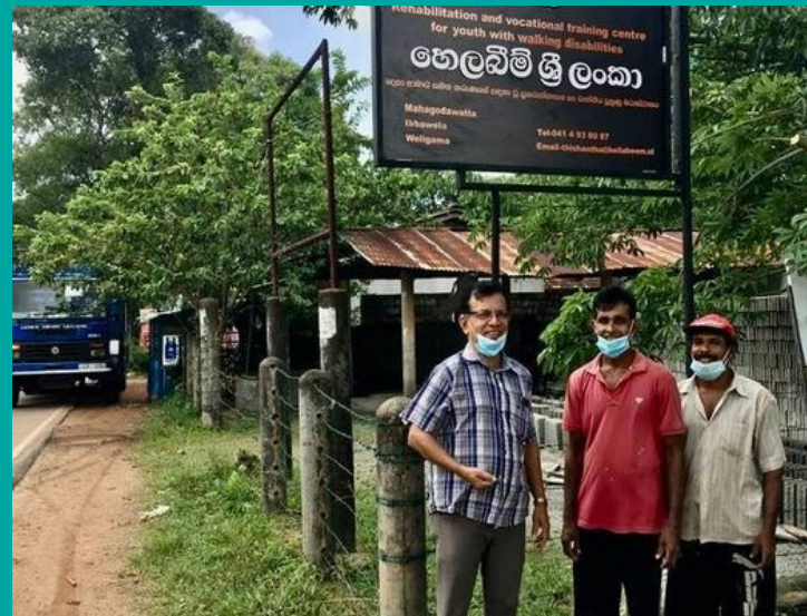
NEW HELLABEEM BOARD