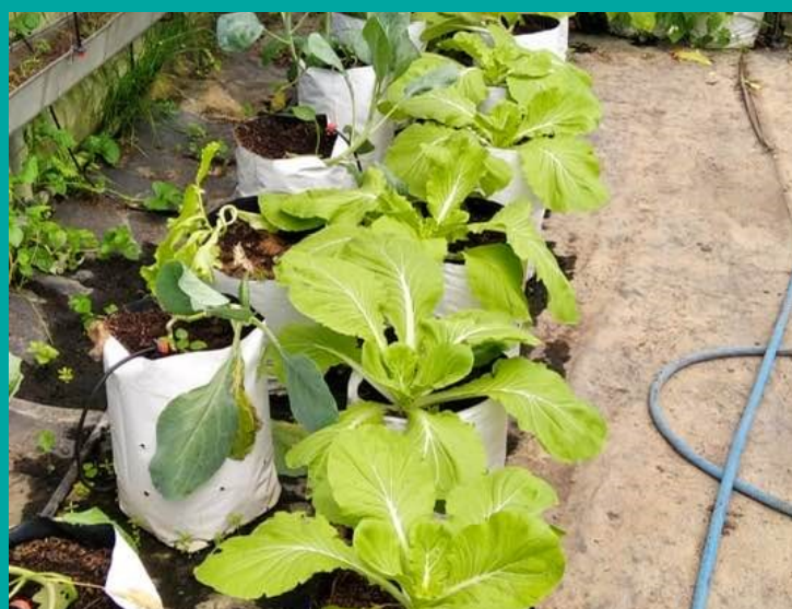
SALAD ON POTS