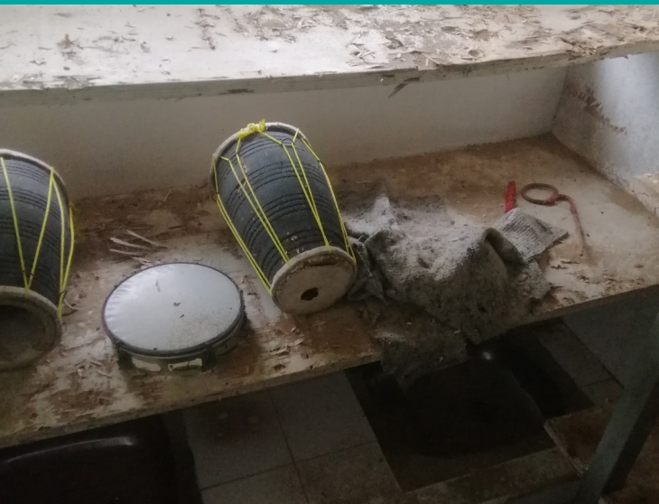
MUSICAL INSTRUMENT DAMAGED