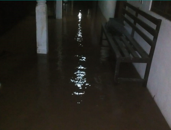
FLOOD AT SCHOOL BUILDING