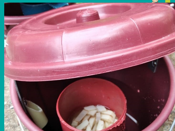
INSECT TRAP COCONUT PEST