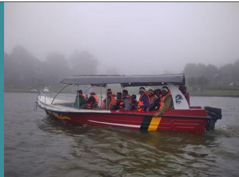
Boat trip on Gregory Lake in Nuwara Elia.