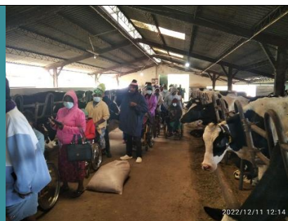
Visit to big cow farm.