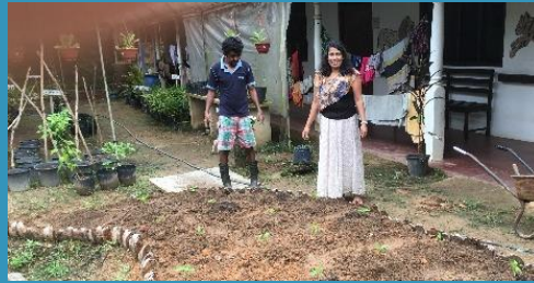
Dhamika old student and Dhamika teacher.

We bought another kind of chicken, long legged, who can eat outside. So, we started to make a special chicken hut and premises for them.